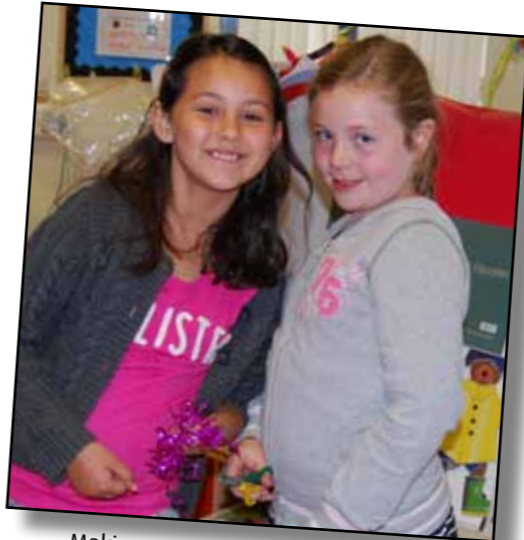
Making new friends at Youth Lyric

The fabulous facilities at St. Ita's Primary School in Belfast provided the venue for the latest highly successful creative summer school. Young people from across Belfast attended our week long celebration of creativity and completed workshops in drama, mime, art and dance! We will be back again in November with a Halloween creative school!