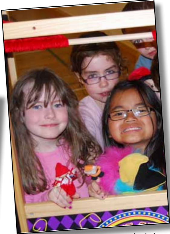
Having fun with the puppet theatre!

Welcome to Youth Lyric News from our Honorary Patron James Nesbitt